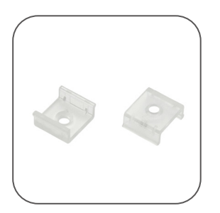
Mounting Clip (PC)